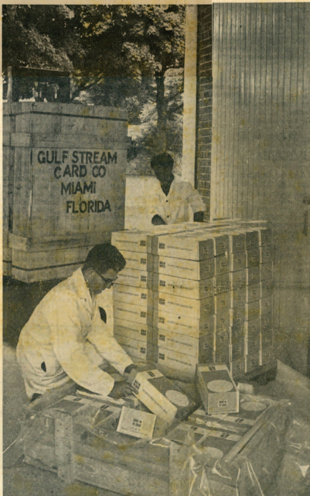
Packaging an export order in the despatch department at the Cabinteely premises.

JOHN HINDE LTD. FINE ART PRINTERS & PUBLISHERS CABINTEELY, CO. DUBLIN